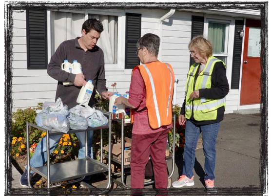
People who are suffering from food insecurity can pick up essentials on the campus of Blessed Sacrament Church in Hamden, part of St. Paul VI Parish, on the second and fourth Saturdays of the month from 9:30 to 10:30 a.m.