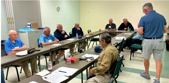
Members at their monthly meeting at St. Agnes Church.