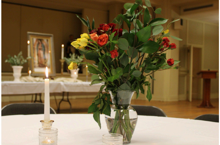
Roses, candles and religious images set a quiet and prayerful tone for a SEEN gathering.

"The name 'SEEN' is important because very often, nobody knows what happened. The parents hold it inside," she explains. "But we're here to affirm the dignity of the life lost. As Catholics, we believe that life begins at conception, and every soul has meaning and purpose."